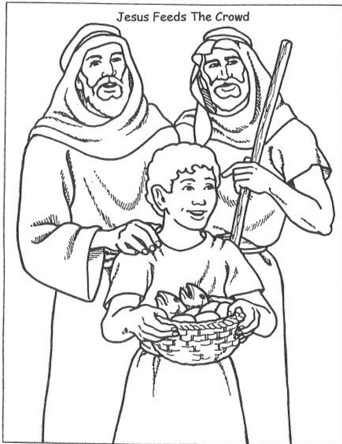
You can read this story in your Bible: Mark 6:30-44