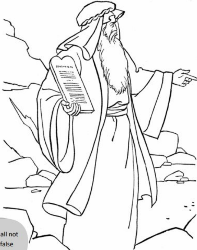
Moses came down from Mount Sinai.

What should we do when we disobey God's DIRECTIONS of love?